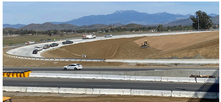
Looking east at the northbound loop off-ramp.

The information in this Construction Alert is subject to change without notice based on weather, field conditions or other operational factors.