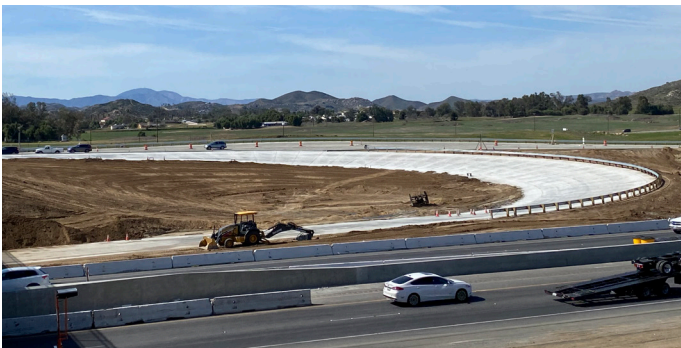
Looking west at the southbound loop on-ramp